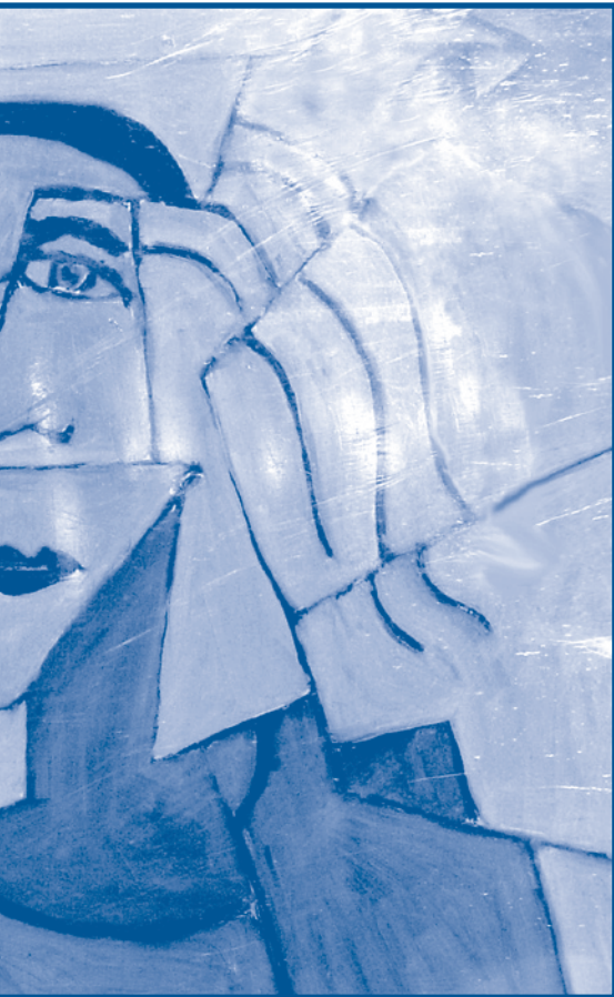
Violence against women.