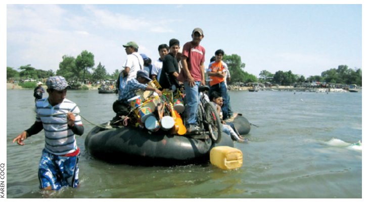
People in makeshift rafts travelling between Mexico and Guatemala near the official border crossing.

After our meeting at the Casa, we make our way to the river that marks the border between Mexico and Guatemala. There are two ways to get across. Most people cram onto makeshift rafts, crossing illegally and hoping to escape the raids by immigration authorities, or worse, by organized crime. Some – like us, with the benefit of a passport – use the modern and heavily fortified bridge that is the official border crossing, with checkpoints and searches by immigration enforcement, customs, and the marines. From this bridge, we can see the rafts crossing, not 500m away.