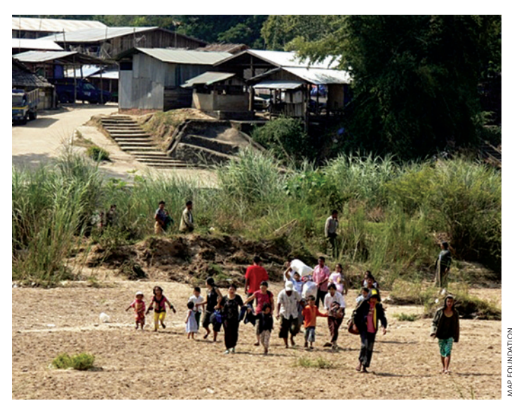
Fleeing from fighting in eastern Burma, these people are crossing into relative safety in Thailand.

MAP works towards a future where people from Burma have the right to stay and the right to migrate safely, and where the human rights and freedoms of all migrants are fully respected and observed. Through community radio, resource centers in various locations, and monthly gatherings all over Thailand, MAP has built solidarity and broken down the isolation migrants experience. Inter Pares is proud to support the valuable work of MAP. 🗶