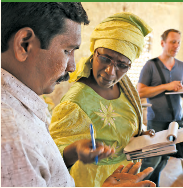
We support women's leadership